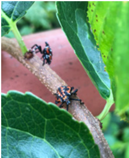
Figure 3. Two spotted lanternfly nymphs crawling on a branch. Nymphs are black and red with white spots, and are about ½" long.