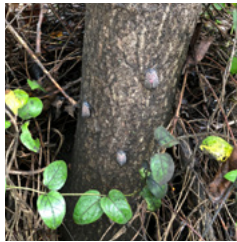
Figure 4. Spotted lanternflies excrete a large amount of honeydew (waste fluid, mostly sugar and water) from their posterior when they feed. This fluid drops down the stem of the plant and also covers vegetation and the ground below. Sooty mold then grows on this honeydew – this is shown as all the black discoloration on and around this Ailanthus altissima (tree-of-heaven).

grayish, adorned with black spots, and the hind wings are banded black and white anteriorly and deep red posteriorly. Adults have wings and can fly from tree to tree; they are also strong jumpers, frequently hopping from location to location. Adults feed throughout the summer, mate, and lay eggs in the fall.