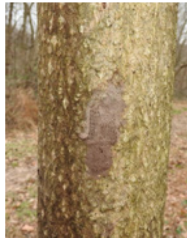
Figure 2. A grey spotted lanternfly egg mass on an Ailanthus altissima (tree-of-heaven) stem. In this photo the bottom portion of the egg mass still has some grey material covering the eggs; this material is deposited by the adults when they lay the eggs. This has worn off on the top part of the egg mass, revealing rows of eggs.

SLF has one generation per year in the Mid-Atlantic region of the United States where it is currently found. The insect overwinters as eggs, which are laid in the fall. Eggs are deposited in masses of 30–50 and covered in grayish, inconspicuous waxy deposits (Figure 2). The eggs can be hard to spot on plant material, but can also be found on non-plant material, such as rocks, vehicles, and equipment, increasing the risk of spreading and widening their distribution. The immature SLF (nymphs) hatch in spring and go through four instars (nymph stages) over about 8 weeks (Figure 3). Nymphs are initially black with white spots, only developing bright red spots during the final instar before becoming adults. Adults are present beginning in mid-summer and are approximately one-inch long and a half-inch wide, with a black head and an abdomen that is mostly black, but may have yellow bands. The forewings are