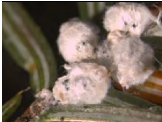
Figure 1. HWA on eastern hemlock.

Both eastern ( Tsuga canadensis ) and Carolina ( Tsuga caroliniana ) hemlock are susceptible to HWA attack. The few native HWA predators are not impacting populations, although work continues with classic biocontrol of HWA to establish more effective predators. In addition, hemlocks in the eastern US lack resistance to HWA. As a result, HWA populations can increase very quickly. A hemlock twig can have hundreds of HWA covering it. Tree death can occur in as little as three years as trees are overwhelmed by unrestrained growth of adelgid populations.