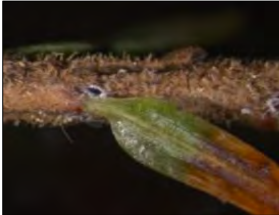
Figure 3. HWA feeding on twig near the base of hemlock needles.