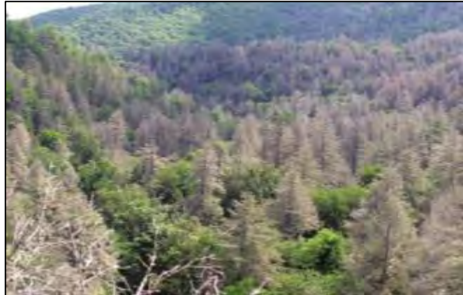
Figure 4. Thousands of hemlocks have been killed by HWA.

Efforts are underway to establish specialist adelgid predators from Asia and the northwestern United States to biologically suppress adelgid populations. However, insecticides will be needed to keep hemlocks healthy until these predators become established. Hemlock pest management is important for federal and state lands, urban forests, and private property. Large HWA management programs have been initiated to reduce HWA populations and preserve hemlock forest health. For example, Great Smoky Mountains National Park (GRSM), which has the largest HWA management program in the U. S., has treated over 250,000 individual hemlocks with the insecticide imidacloprid. Imidacloprid treatments are the most commonly used and effective method of suppressing HWA.