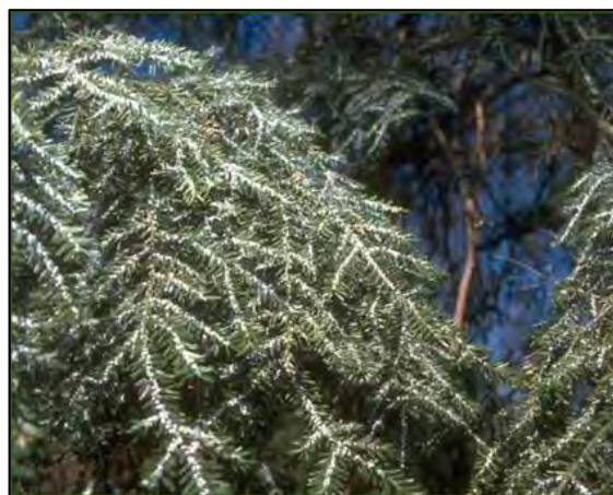
Figure 2. HWA on eastern hemlock branches.