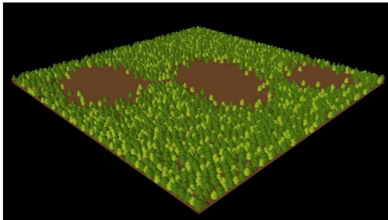
Figure 1a—String of Pearls.

If understory thickets are to be created by multiple clearcuts and a stand-wide thinning is to take place as parts of the same harvest operation in the same stand, it is important to mark the thickets (clearcuts) first, to know how many acres and how much canopy opening will result from them before marking the thinning. When determining the number and size of understory thickets to be created in a particular stand, the canopy openings generated from the combined harvest (clearcuts and thinning) must be included in the total canopy opening estimate. To reiterate, for the best possible bottomland hardwood bird habitat conservation outcome, patch clearcuts should not exceed 10 percent of a given stand, and all accompanying thinning (single tree and group selection) should not reduce canopy closure below 60-70 percent.