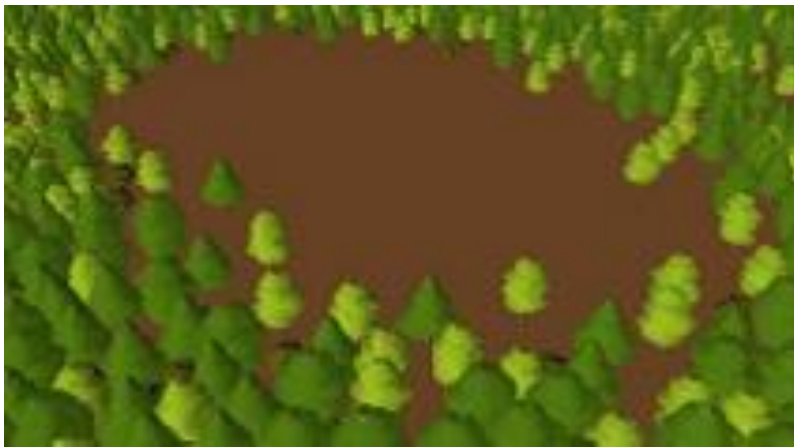
Figure 2—Feathered Edges of Clear-cut.

Kentucky warbler ( Geothlypis formosa ) and Hooded warbler ( Setophaga citrina ) Mature bottomland hardwood forest, with lush ground cover for nesting and a fair bit of canopy openness. Utilize large diameter downed logs for foraging and nesting near. Results reported by Norris et al. (2009) suggest that thinning established bottomland hardwood stands, which does not reduce canopy closure below 60-70 percent, improves habitat for several birds that need conservation action, while not dramatically degrading the habitat for several others that also need such help.