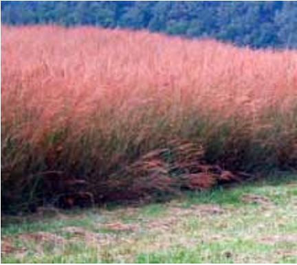
Indian grass • Sorghastrum nutans