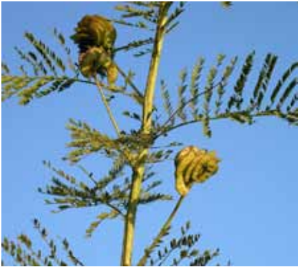
Illinois Bundleflower • Desmanthus illinoensis