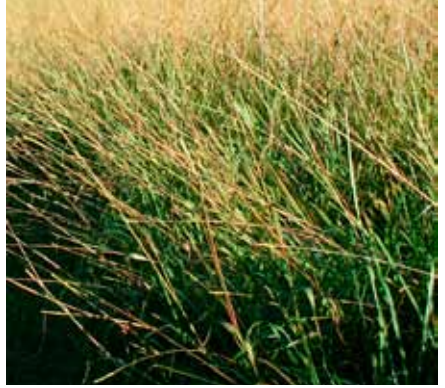
Eastern gamma grass • Tripsacum dactyloides