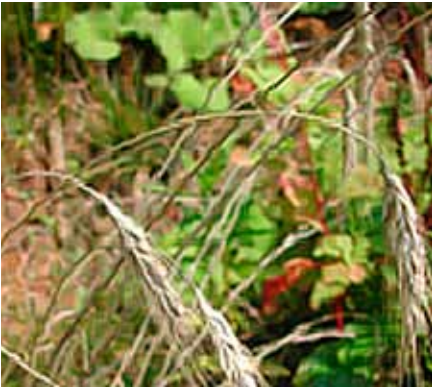
Virginia wild rye • Elymus virginicus