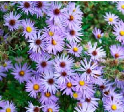
New England Aster • Aster novae-angliae