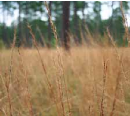
Wiregrass • Aristida stricta