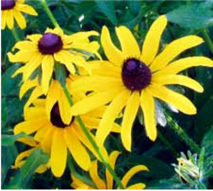
Blackeyed susan • Rudbeckia hirta