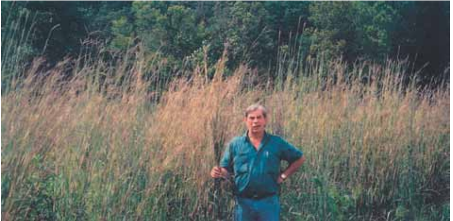
Using high quality cleaned and conditioned seed pays.