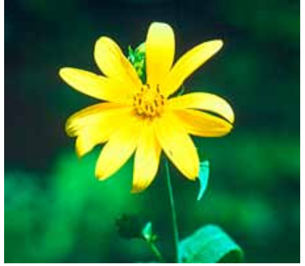
False sunflower • Heliopsis helianthoides