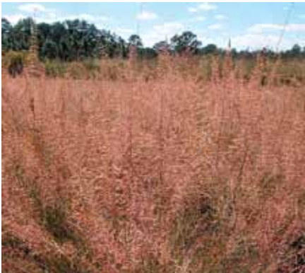
Pineywoods dropseed • Sporobolus junceus