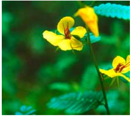
Partridge pea • Cassia fasciculata