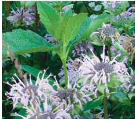
Bergamot • Monarda fistulosa