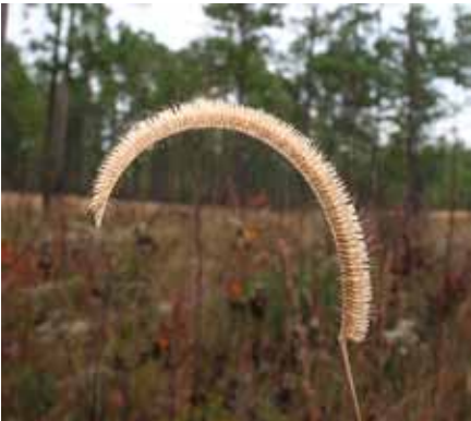
Toothache grass • Ctenium aromaticum