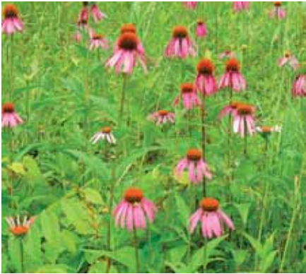
Purple coneflower • Echinacea purpurea