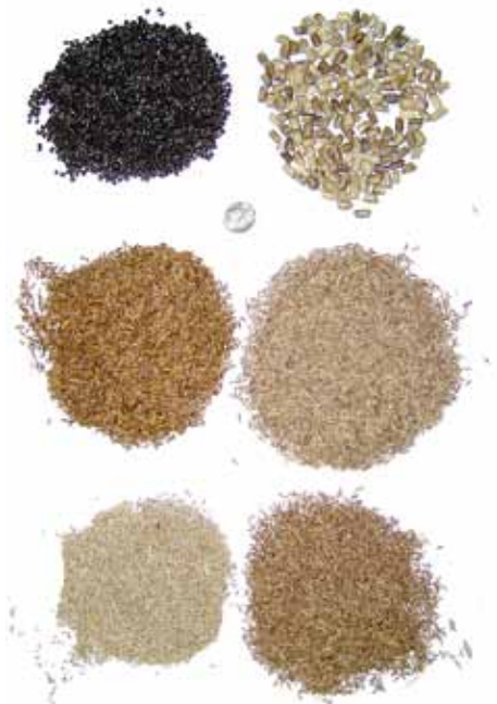
Quality seed is free of chaff and weed seed, and has a current seed test showing Purity and Germination.

Seed shipped out directly to consumers evades any quality inspection by state regulatory services or any other agency designated to protect consumer interests. Such practices create a dumping ground for old, mislabeled, and poor quality seed. Seed industry analysts are reporting that low demand over the past few years has resulted in large inventories of old seed stored in bins without heat and moisture control.