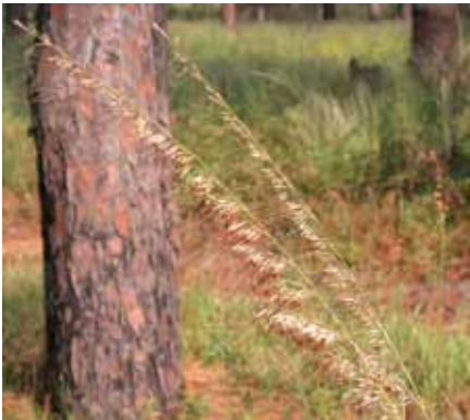
Lopsided indian grass • Sorghastrum secundum