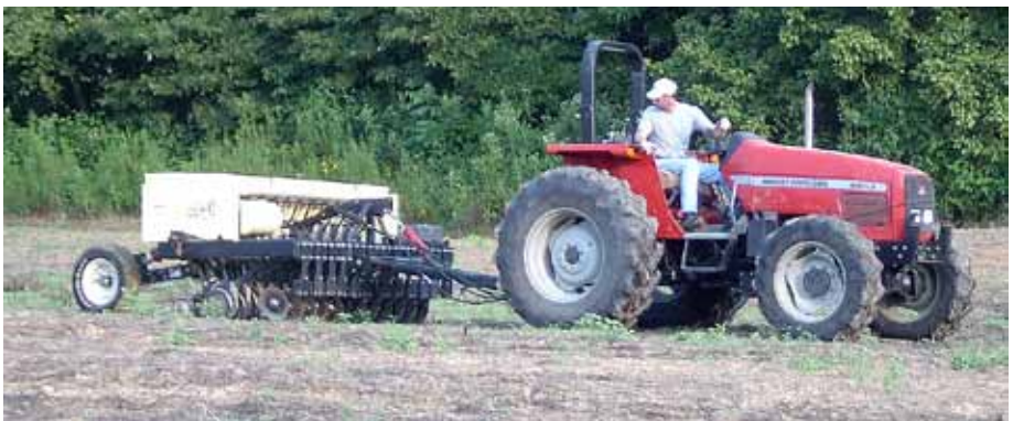
Drilling warm season grass seed using warm-season specialty drills.

Debarbed seed with the chaff cleaned out can be run through a conventional drill or can be broadcast when special care is taken as will be explained later in this booklet. A possible exception to this is Little Bluestem, which can rarely be debarbed completely without damaging the seed. Mixes with minor percentages of debarbed Little Bluestem should be okay to run in a conventional drill with careful monitoring. We recommend the use of specialty warm season no-till drills even for debarbed seed due to other features normally included that aid in accurate seed placement. With the extremely low CRP seeding rates it is critical that every seed possible be placed to maximize germination.