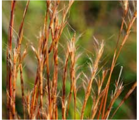
Little bluestem • Schizachyrium scoparius