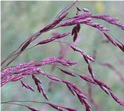
Purple top • Tridens flavus