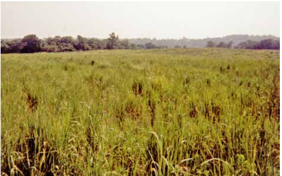
A wildlife habitat planting 12 months after seeding. This field was seeded on June 21 in a dry year.

The danger in planting late is the increased possibility of reduced soil moisture. Generally, the optimum time for seeding NWSG seed in the southeastern United States is mid-May to mid-June. In the Deep South, seeding may begin as early as March 15. Two weeks earlier is okay if you are absolutely certain there will be no warm season grass and weed competition. In normal to moderately below normal moisture years successful plantings have consistently been completed as late as the last week in June. At these later dates it is even more important to eliminate competition for soil moisture.