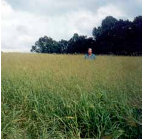
Forage planting at 90 days

Be patient —it takes much longer to establish a stand of NWSG than it takes to establish a stand of cool season grasses. What may look like a weed patch in the first growing season can be a good stand. If in doubt, ask your DC, a Fish & Wildlife-Resources biologist, or your seed producer.